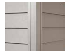
4" traditional corner post with foam insert