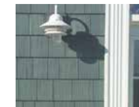
5" fluted lineals as a door surround