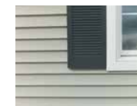
3 1/2" insulated lineal window trim (5" also available)