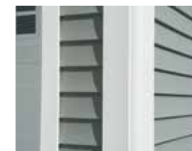
Beaded corner post