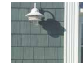
5" fluted lineals as a door surround