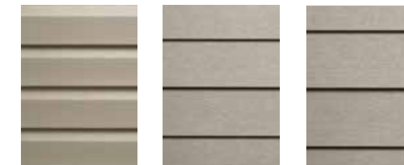
5" dutch lap profile 6" clapboard profile 7" clapboard profile

Preservation's Integra captures the timeless look of traditional plank siding for superior style and performance.