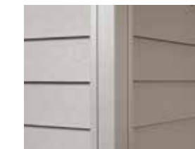
4" traditional corner post with foam insert