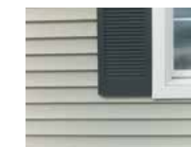
3 1/2" insulated lineal window trim (5" also available)