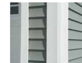
Beaded corner post